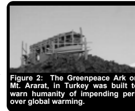
Figure 2: The Greenpeace Ark on Mt. Ararat, in Turkey was built to warn humanity of impending peril over global warming.